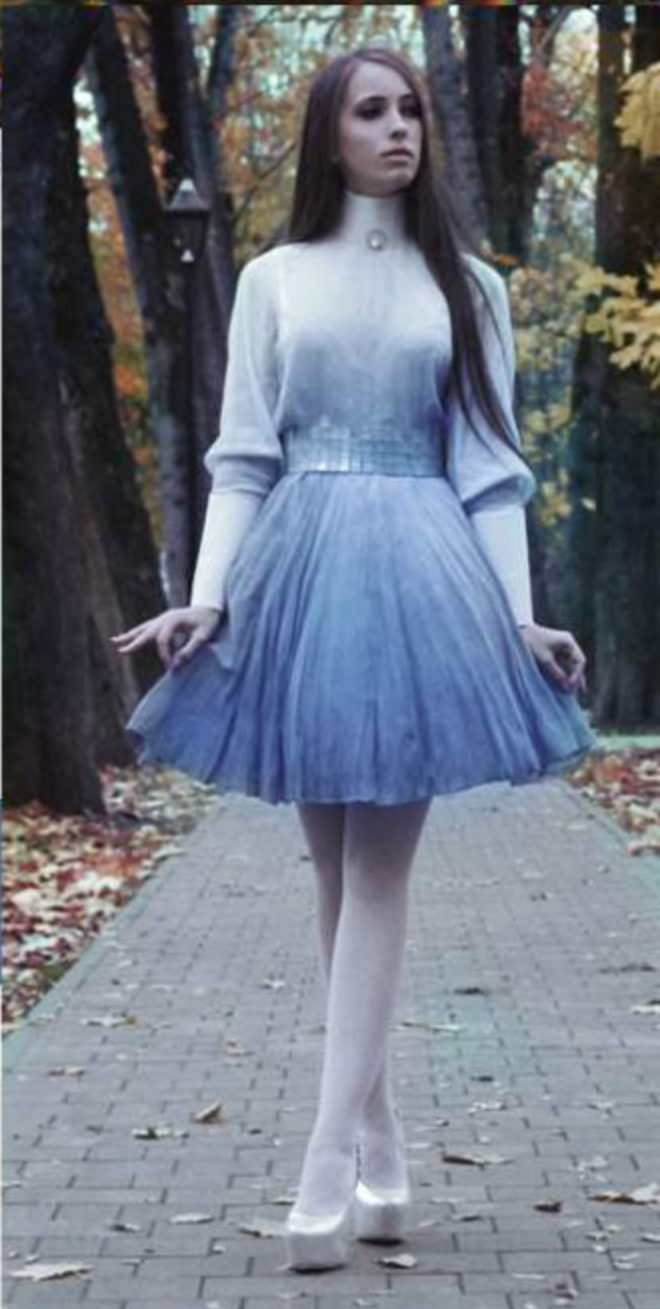
coctail chiffon ombre dress with iridescent glass mosaic belt