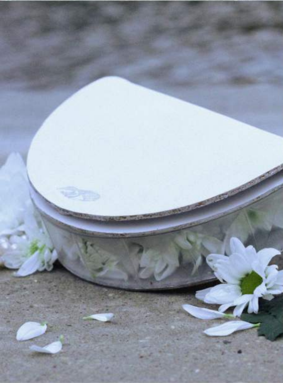
PEARLY CLUTCH BAG